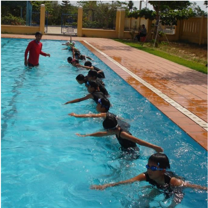
Look at our new pool. Isn't it brilliant! It comes complete with changing rooms and showers.

The summer is speeding past and we are already at the end of the second program of 2010. Due to the huge generosity of a local business woman, this year we now have our own swimming pool which has been built in one of the local primary schools. Having access to this makes a huge difference. We can hold more lessons and classes can be more varied and fun (and noisy!) than they can be in hotel swimming pools. We now have more local teachers and a constant stream of highly experienced volunteers. Therefore we have been able to significantly increase the number of children taught this year. Already 300 children have completed the course this summer and we aim to train 400 more before the end of the season. We also have increased our focus on advanced swim training. We now have 45 children taking part in mini-squads where they are increasing their endurance and learning all swimming strokes. We are organising some inter school competitions where they can show off their new skills.