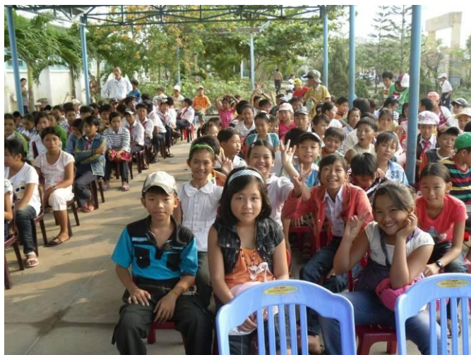
180 proud kids on program one graduation day..